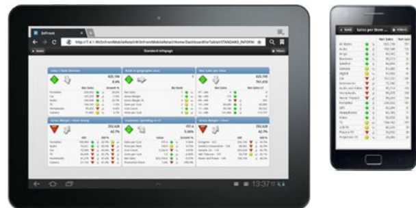
Access to Business Performance with Mobile Devices