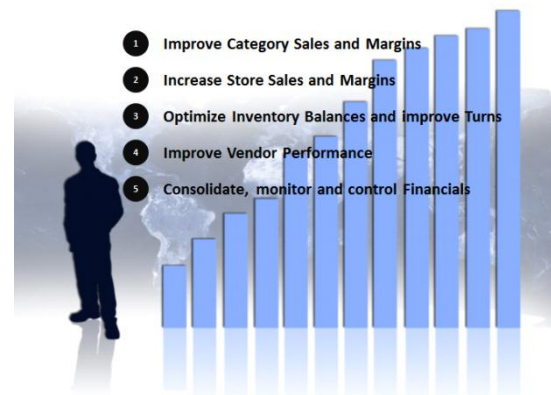
Profitbase Retail BI Solution Benefits